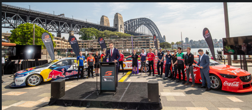
Supercars launched their 2020 season beneath the iconic Sydney Harbour Bridge.