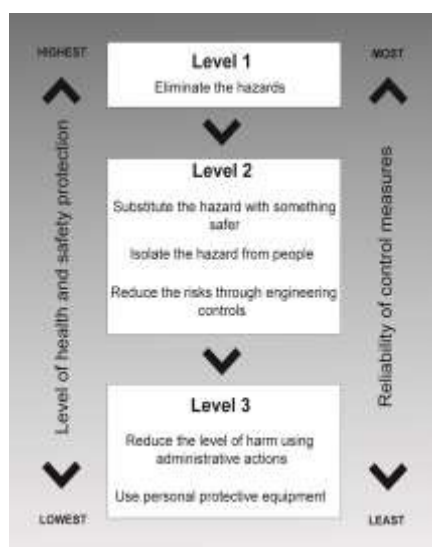
Figure 4: Hierarchy of Controls

Motorsport Australia also appreciates that when it is required to address a safety related hazard in any of its areas of activities, the options that are identified to control, or if not control, reduce the risk shall be assessed against the following schematic diagram. There will be occasions where the most effective option will be assessed to see if it is reasonable practicable in the circumstances to implement. This needs to be objectively assessed against the criteria following.