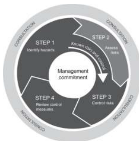
Figure 3: Risk management procedure