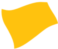
YELLOW Danger ahead – slow and be prepared to take avoiding action