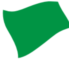
GREEN All clear ahead