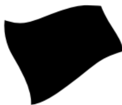
BLACK Enter pit lane on the next lap