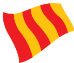
YELLOW WITH RED STRIPES Deterioration of adhesion / slippery surface ahead