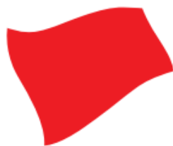
RED Stopping the race or practice