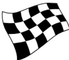
BLACK & WHITE CHEQUERED Finishing flag – end of race or practice