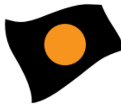
BLACK WITH ORANGE DISC Mechanical problems: stop at pit on the next lap