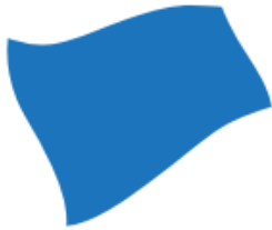
BLUE Overtaking signal

The illustrations below provide a quick colour reference to the flag signals. Refer to “Track Control and Flag Signalling in the Circuit Race Appendix in the Motorsport Australia Manual for full information on these and other signals which are used in motor racing.